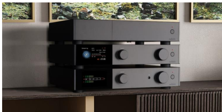
Left: Audiolab’s award-winning 9000N network streamer (middle) is a brilliant match with the 9000Q/P.

“Above all, whether used together or deployed separately, the 9000Q and 9000P must deliver Audiolab’s best sonic performance. We believe they raise the bar, not only within the Audiolab range but across the entire industry at their retail price points.”