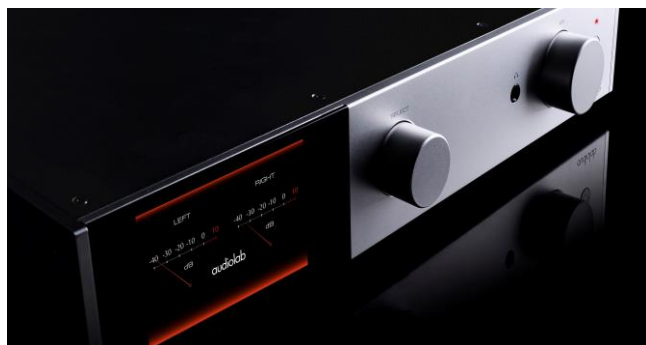
Left: The 9000Q's GUI offers many display options including a digital representation of an analogue VU meter.

As with other 9000 Series components, various display options include a VU-style meter showing real-time decibel levels for the left and right channels as music plays. The display can also be simplified, dimmed or turned off completely, as the user prefers.