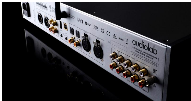
Left: A comprehensive array of digital and analogue connection options adds to the 9000Q's flexibility.

Further flexibility is provided by 'AV Direct' mode, which delivers direct throughput from one of the 9000Q's line-level inputs – useful for connecting an AV processor or another device with its own volume control. There is a fixed-level stereo RCA output too, which also bypasses the volume control, plus a headphone output and a pair of 12V trigger outputs for automated system power up/down.